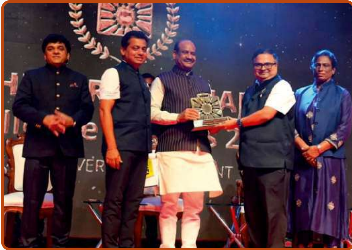
Hon'ble Speaker of the Lok Sabha, Shri. Om Birla, Awarded FUEL the "Change-Maker in Skill Development" at the CSR Journal Excellence Awards 2023.