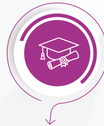
Student Research Publications