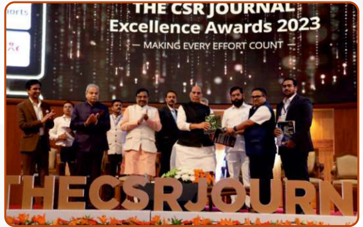
FUEL was honored by recognition at the CSR Journal Awards 2023 from Respected leaders Hon'ble Defense Minister Rajnath Singh Ji & Hon'ble Chief Minister Eknath Shinde Ji