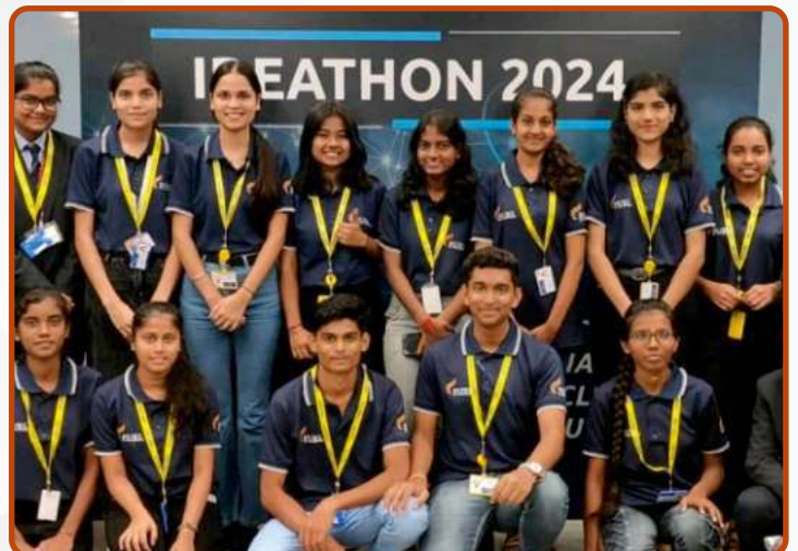
Industry Visits BBA Students Participating in the Ideathon Organized by Capgemini & Barclays