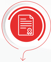
Skill based Certification