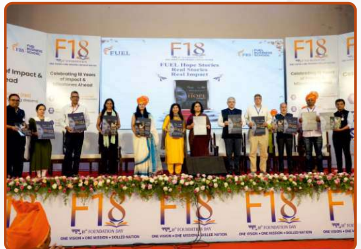
Launching hope stories with CSR panel