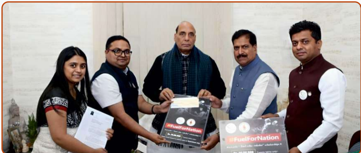
FUEL Launched Unique Program "Edu-Raksha" For Soldiers Children with Defence Minister Shri Rajnath Singh & Late Shri. Suresh Angadi (Mos Railways)