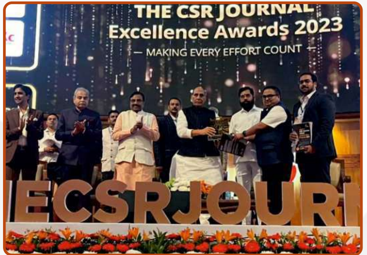
Hon'ble Defence Minister of India Shri, Rajnath Singh, Awarded FUEL the "Change-Maker in Skill Development" at the CSR Journal Excellence Awards 2023.