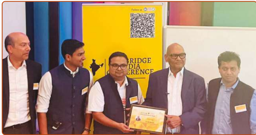
FUEL Team with Shri. Anil Agarwal, Chairman Vedanta