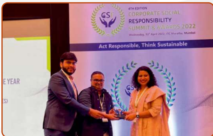
FUEL received "CSR" Implementation Partner of the year Award at CSR Summit Award 2022 (4 th edition)