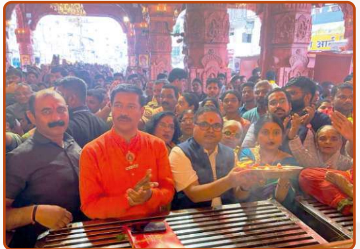
FUEL Team at Dagdusheth Halwai Ganpati