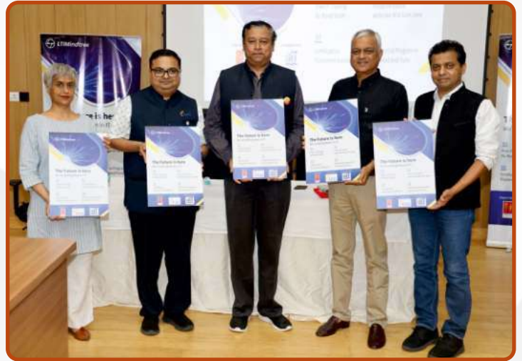
LTIMindtree Foundation, FUEL, IDRP & IIIT Dharwad Launch Skill Development Program for Future Skills (Dharwad)