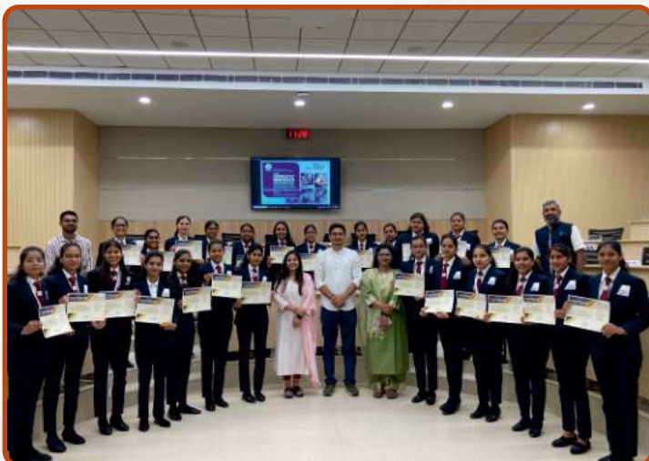
Domestic Immersion Program at IIM Nagpur