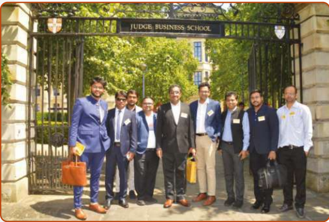
FUEL Team at JBS, University of Cambridge Judge Business School, Uk.

UNIVERSITY OF CAMBRIDGE Judge Business School