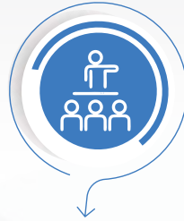
Learn from leaders