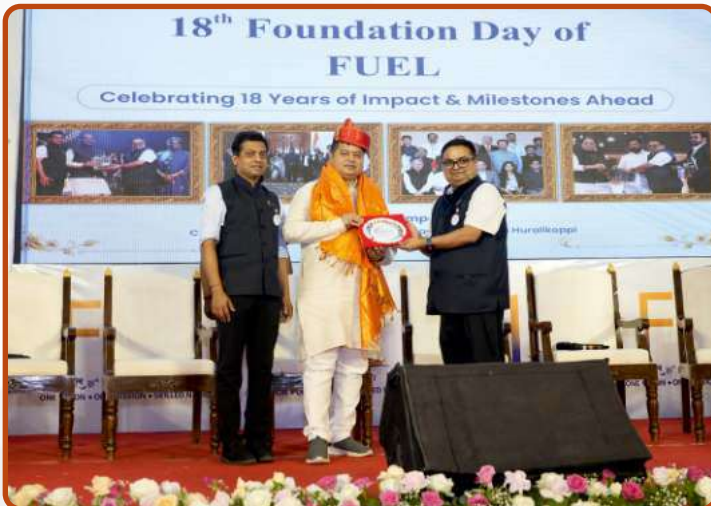
Chief Guest Hon'ble Shri. Raj Bhushan Choudhary Union Minister of State (Jal Shakti) Government of India