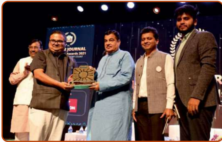
Hon'ble Union Minister Shri. Nitin Gadkari Ji Awarded FUEL "Change-Maker in Skill Development" at CSR Journal Excellence Awards