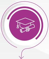
Global Immersion Program