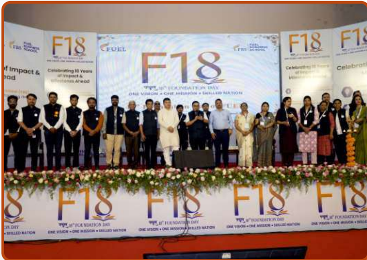
Chief Guest Hon'ble Shri. Raj Bhushan Choudhary Union Minister of State (Jal Shakti) & FUEL Team