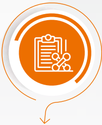
Grassroots Immersion Program (GRIP)